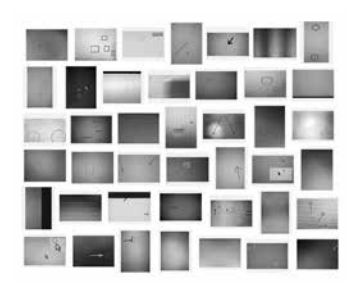
Penelope Umbrico, "Bad Display (Drawings/ eBay)," group of 42, 2016, color laser print on acetate, each 8 1/2 x 11", dimension variable overall, is currently on view at Mark Moore.

here as hand-punched and self-titled "Perforations," others are shredded or pinned "Labels."