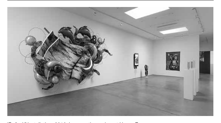
"Default" installation, 2016, is currently on view at Honor Fraser.

computer screen. Fascinated by the the images she encountered where it seemed impossible to make a non-reflective image of a screen, she broadened her search on sites like Craig's List and eBay looking specifically for images of screens presented for resale. What she found were images with highlights and light-bursts from a flash that illuminate scratches and streaks on the seller's screen. These "glitches" are the sought-after nuances in Umbrico's appropriation of these images. The installation of "Bad Display" images spans the gallery walls, filling them with variously sized photographs, some black and white, others color. Umbrico's presentation transforms these found anonymous photographs screens into something aesthetically pleasing. Her work is as much about the individual image as it is about the installation, though more often than not she organized her appropriated imagery into grids or leans them against the wall, which foregrounds the group rather than the unique image. Umbrico also presents images of useless hardware and cables as well as a series in which the seller has illuminated the screen's defect by a circle or arrow. Her expansive project reflects on the seemingly infinite similarities and differences that can be found by Google searching a particular word.