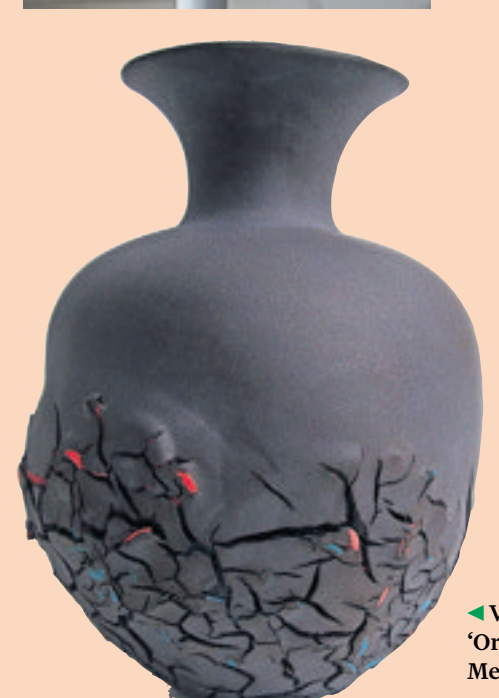
▼Van Essen's 'Ornamental Metamorphosis'