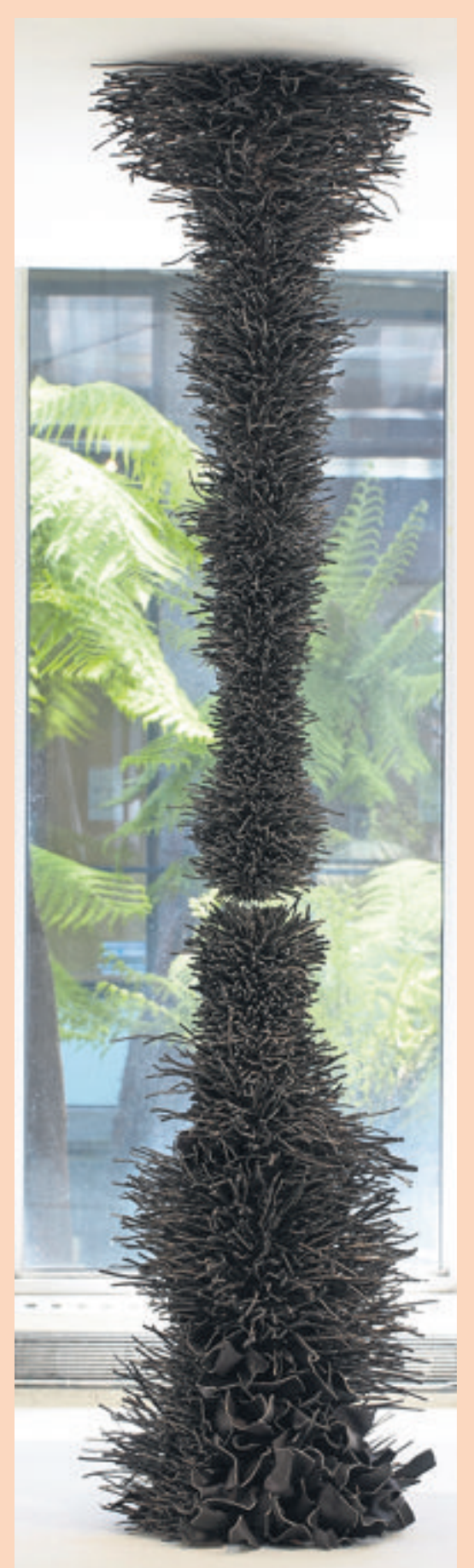
Peled's forest of shards installation at the RCA