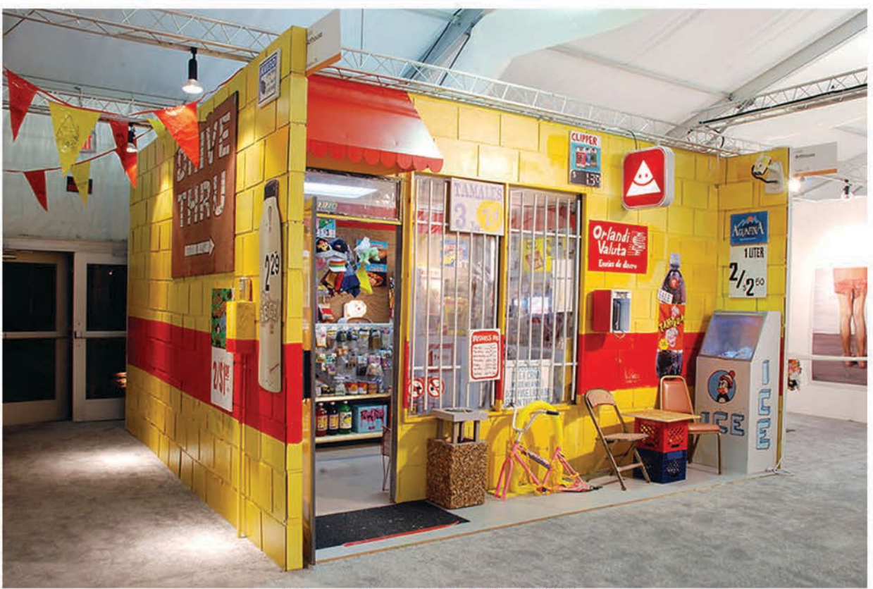
"Corner Store," Pulse Miami 2009