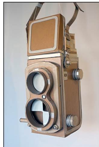
Mark Moore Gallery

Mark Moore Gallery , Bergamot Station, 2525 Michigan Ave., Santa Monica, (310) 453-3031, through Nov. 14. Closed Sunday and Monday. www.markmooregallery.com