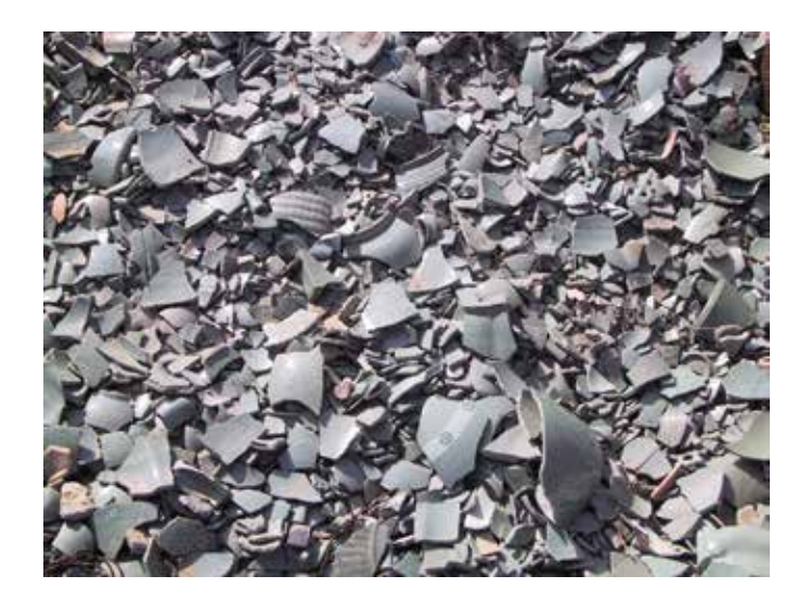
A landscape of celadon shards in situ behind ceramic kilns, South Korea, 2002.