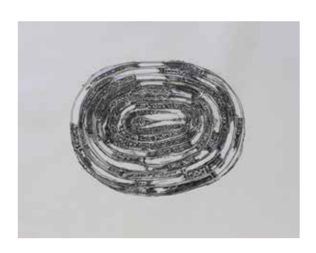
Annual Rings, 2015, graphite on paper, 18 x 24 inches.