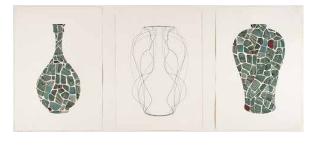
Jean Shin, Celadon Threads , 2008, digital embroidery and stitching, ink-jet print on Arches Paper, 49.5 \times 23 inches.

JS: In a very literal way, Celadon Landscape is an installation whose material and cultural history were imported from Korea to America. By creating a landscape, one "naturalizes" the material in all senses of the word. This, too, is a process of inclusion, one specific to being American.