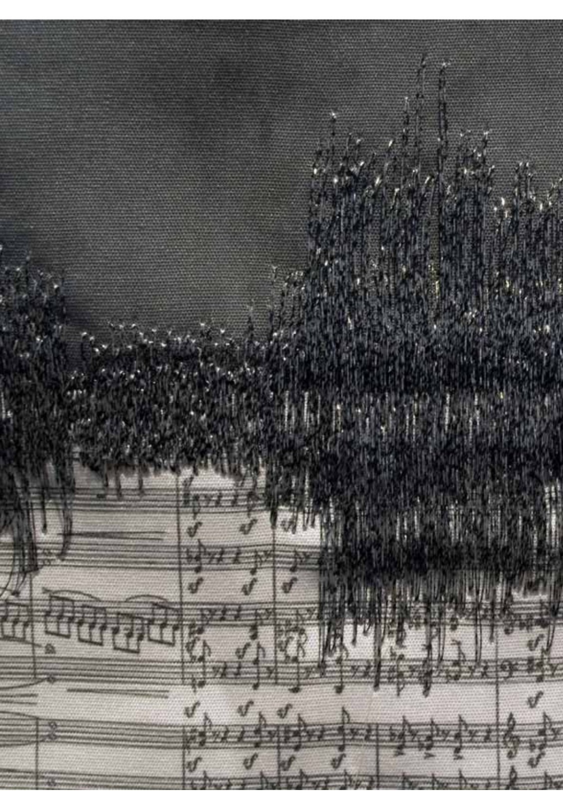
And We Move (Pause) (detail), 2008, inkjet prints on cotton fabric, with digitized embroidery, 32.5 x 42 inches.