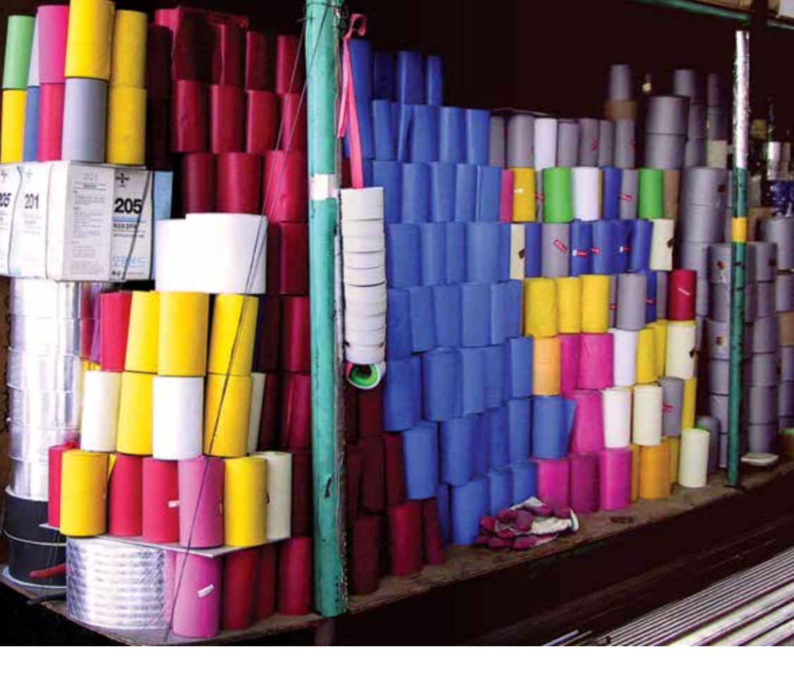
Found Installation ( Vinyl\ Rolls ), 2002, digital C-print, 16 x 20 inches. Courtesy of the artist and Cristin Tierney Gallery, New York