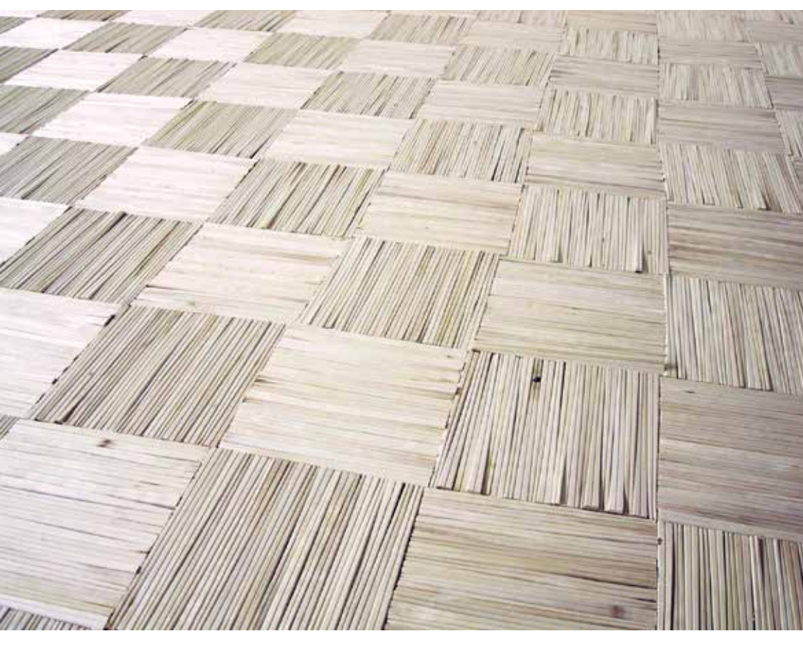
Wooden Floor (detail), disposable wooden chopsticks, dimensions variable.