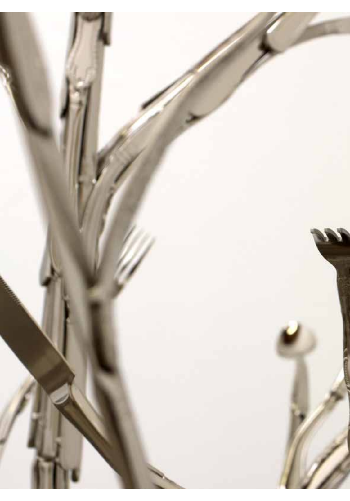
Grafted Settings 2 (Sapling) (detail), 2015, nickel-plated stainless steel flatware, 47 x 31 x 11 inches.