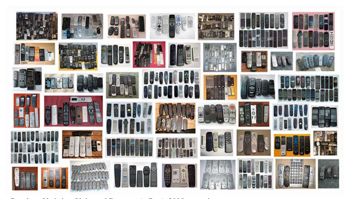
Penelope Umbrico, Universal Remotes (e-Bay), 2008 - ongoing

PU – Yes! And especially the pictures we post of themselves online. There we're atomized into millions of immaterial representations. Pictures that were intended to say 'I am here' become part of this collective online archive and do just the opposite – they become a part of an anonymous sea of millions of people that are everywhere and really nowhere at all. And that is the life of a ghost, a total purgatory, or limbo that is neither heaven nor hell, just floating around in this insubstantial in-between.