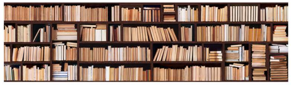
Penelope Umbrico, Embarrassing Books

MAD – I do think that the notion of the transcendent or redemptive power of art has been overblown with maybe centuries of hyperbolic rhetoric from art historians, critics, and artists themselves, so perhaps it has become an impossible expectation. But clearly humans desire to express themselves esthetically and there are lots of reasons people go to museums or galleries but one of them is to see something they have never seen before, to refresh or challenge their perceptions on some level.